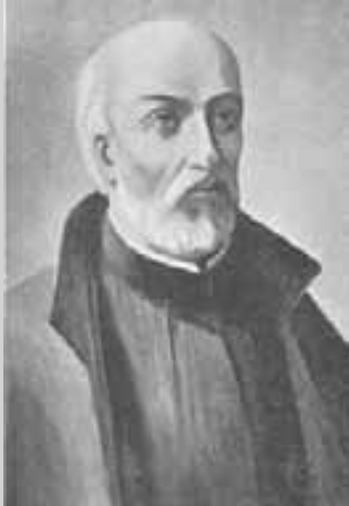
St. John de Brebeuf